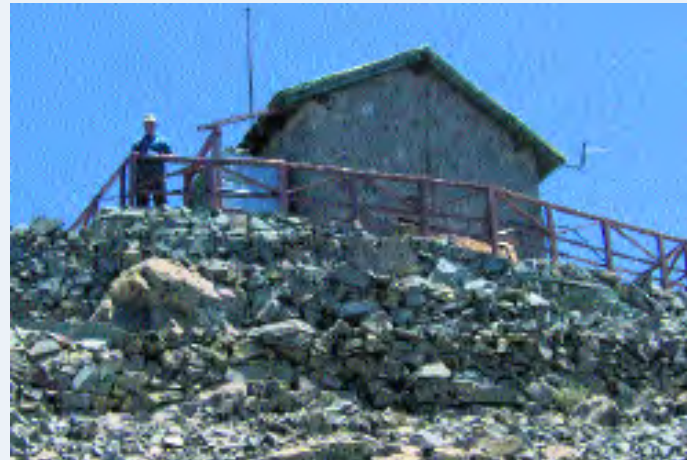
Madari Fire Look out Station

The degree of difficulty of the trail is 3 (in a scale ranging from 1 to 5), because of its length. The most difficult to walk is part 2 (Madari Fire Look out Station - Selladi tou Karamanli).