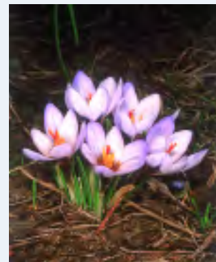
The Cyprus Crocus ( Crocus cyprius )

the Eastern Strawberry tree ( Arbutus andrachne ), the Peony ( Peonia mascula ), the Barberry ( Berberis cretica ), the Rock-Rose ( Cistus creticus ), the Three - leaved Sage ( Salvia fruticosa ), the Fern ( Pteridium aquilinum ), the Sumach ( Rhus coriaria ), the White Beam ( Sorbus aria ), the Hawthorn ( Crataegus monogyna ), the Cotoneaster ( Cotoneaster racemiflorus ), the Maple ( Acer obtusifolium ), the Plane Tree ( Platanus orientalis ), the Etruscan Honeysuckle ( Lonicera etrusca ).