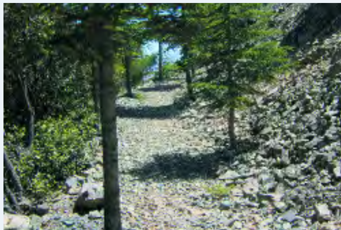
Part of “Madari” Nature Trail

The locality “Doxa Soi O Theos”, 2Km from Kyperounta village and 5 Km from Spilia village, on the road Kyperounta - Spilia - Kannavia, at an altitude of 1335m. The walker has the opportunity to choose among alternative starting points and trail routes.