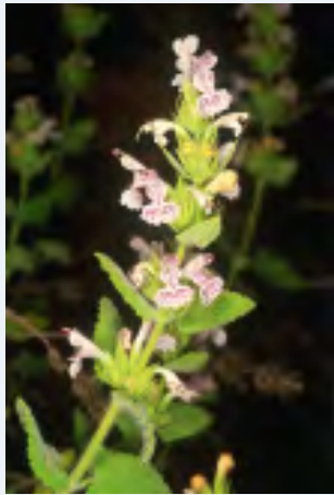
The Troodos Cat - mint ( Nepeta troodi )

cyprius ) which flowers in January - February and is a strictly protected species and the Thyme ( Thymus integer ). Some other species are: The local Juniper species ( Juniperus excelsa ) which, in Cyprus, is confined to Madari area, the Prickly Juniper ( Juniperus oxycedrus ), the Black pine ( Pinus nigra ), the Calabrian pine ( Pinus brutia ), the Dog rose ( Rosa canina ), the