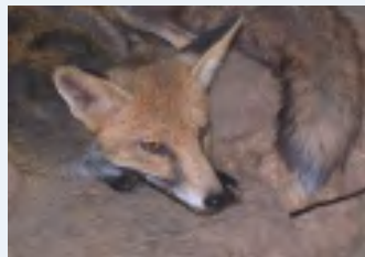
The fox ( Vulpes vulpes )

If you have an interest in wild life, you may have the chance to observe different small animals like the fox ( Vulpes vulpes ) and the hare ( Lepus europaeus ) and birds like the protected Raven ( Corvus corax ), the Bonelli's Eagle ( Hieraetus fasciatus ) and the Short-toed Treecreeper ( Certhia brachydactyla dorotheae ).