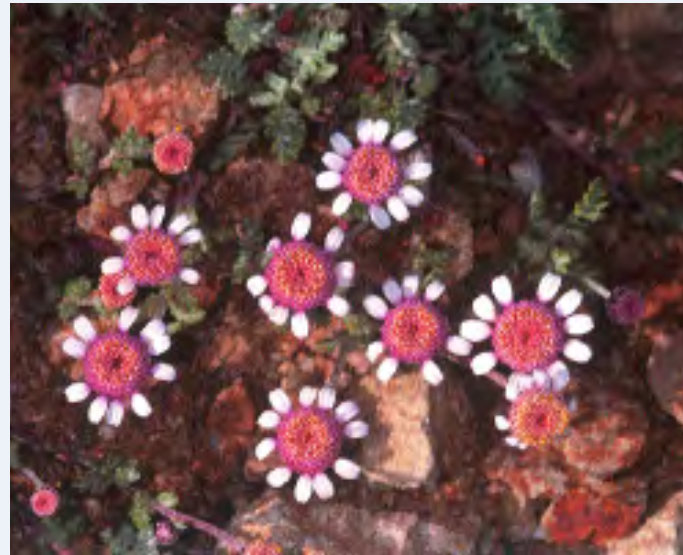
The Plutonian Chamomile ( Anthemis plutonia )

We wish you a pleasant walk and you are kindly requested to keep in mind the following: