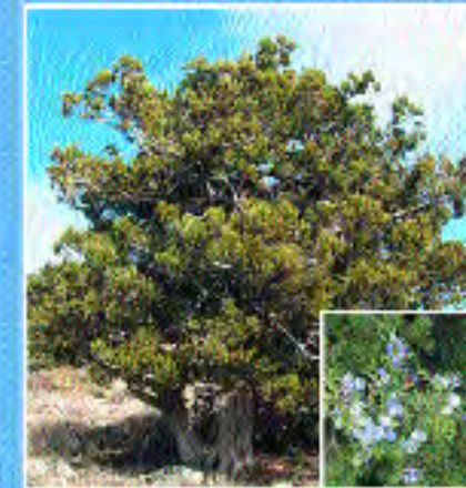
Juniperus excelsa M. Biem - Grecian Juniper.