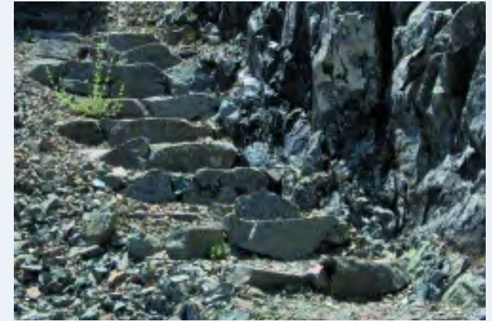
Steps along high gradient